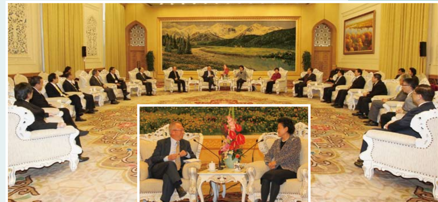
State Councillor Liu Yandong received a FHKI Delegation at the Great Hall of the People in Beijing. 國務委員劉延東在北京人民大會堂接見到訪的工總高層代表團。