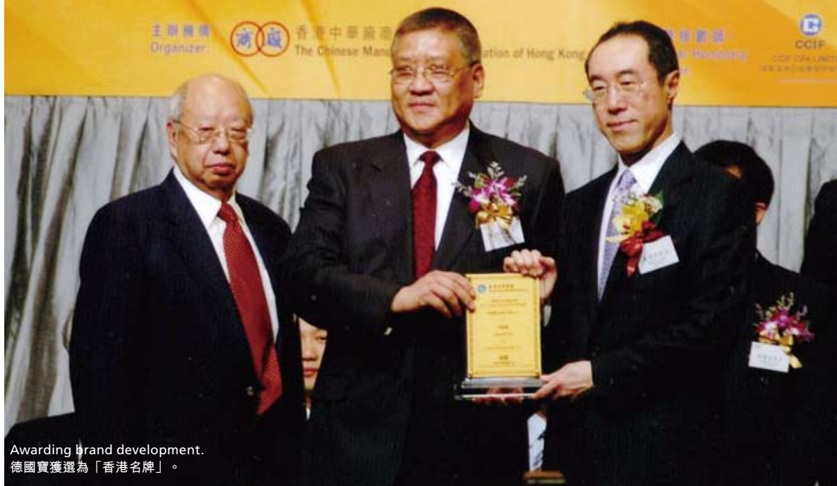
Awarding brand development. 德國寶獲選為「香港名牌」。

manufacturers believed they had their own secret to success and were reluctant to exchange with others. Now, they understand that they will be no better than the inexperienced if they do not change this attitude. In recent years, more and more manufacturers are joining factory visits and experience sharing sessions organised by various chambers of commerce.”